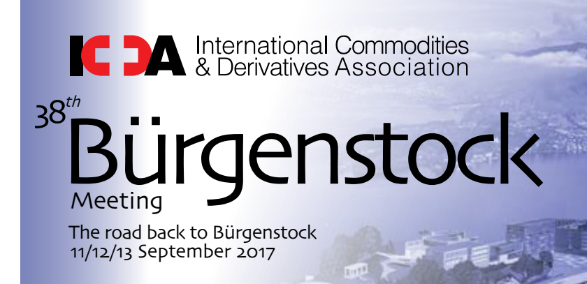
Register online at Burgenstock.org