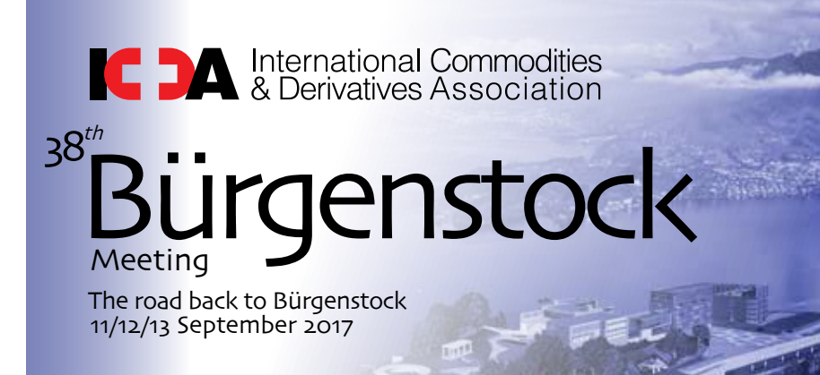
Register online at Burgenstock.org